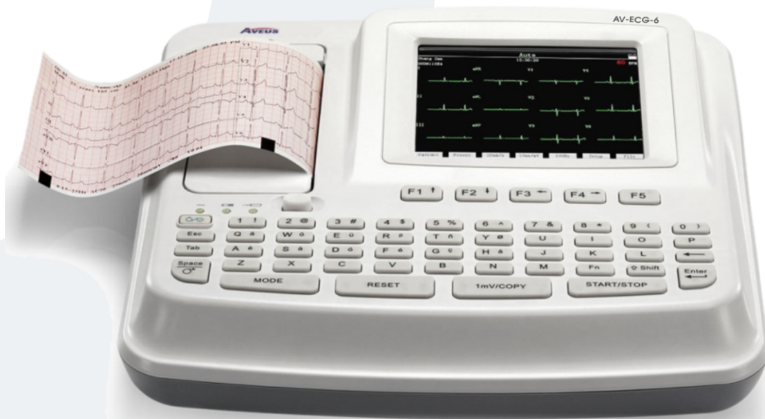
AV-ECG-6 5.7" Color LCD Display